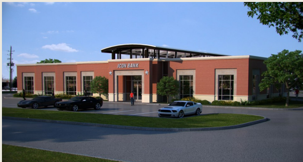
Above: Rendering of the new Sugar Land office.

Construction is in progress for the Sugar Land permanent office. The office, located at 16744 Southwest Freeway; Sugar Land, TX 77479, is scheduled for completion in February of 2014.